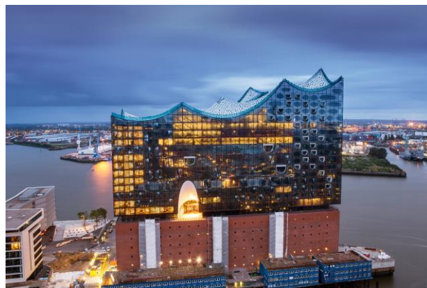
The dramatic Elbepharmonie concert hall complex

With a “same only different” feel, starting in familiar territory but becoming increasingly deranged, the music is the brainchild of the Elbepharmonie Orchestra in Hamburg, Germany. Goto forseasonsbydata to learn the remarkable story of “For Seasons” and to hear it performed in the amazing Elbepharmonie.